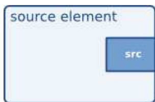
Figure 5-1. Visualisation of a source element

Source elements do not accept data, they only generate data. You can see this in the figure because it only has a source pad (on the right). A source pad can only generate data.